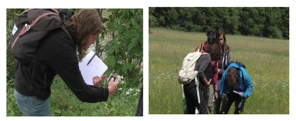
Figure 4.7: Students carry both tools simultaneously; paper-based for writing text information and mobile devices to capture multimedia data such as photos and videos.

Therefore, most students got their text data by using paper-based tool, while the multimedia information, such as photos and videos by using mobile devices as shown in figure 4.7.