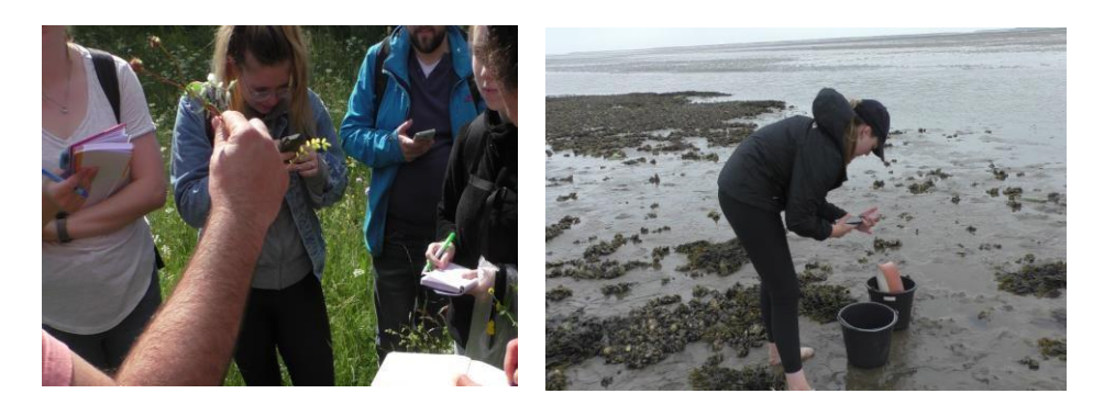
Figure 4.8: Difficulty to write text information by using the mobile devise, such as in the sunny weather in the left, or wet environment in the right

or the tutor in what they were discussing when using the smart mobile devices. That was because the touchable keyboard in these devices makes the typing function difficult and requires concentration to type correctly. In addition, it was observed, as well as students mentioned int the interview session, that the mobile screen was not very clear under sunshine outside in the field (see figure 4.8), especially on sunny days, while capturing data information. In addition, carrying these devices around a harsh or wet environment, such as on field trips, was considered not convenient or safe to use (see figure 4.8).