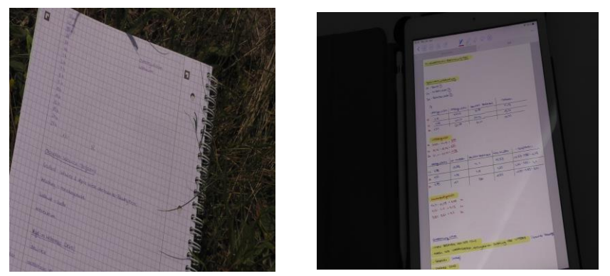
Figure 4.2: The student's notes include quantitative Data

Therefore, the Marin ecology students collected a quantitative data from the field, by using both mobile devices and paper-based tool (figure 4.2).