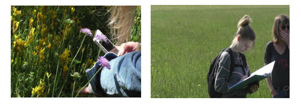
Figure 4.6: Students taking notes with different tools during Botany Biodiversity field trip.

The participants used notebooks mainly for note-taking but stilled some students used their mobile phones to take their text notes. Also, mobile phones were used mainly for capturing photos and recording videos as shown (Figure 4.6). Also, two students used a digital camera.