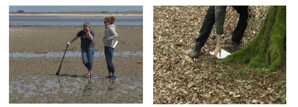
Figure 4.5: Difficulty in using and carrying paper-based tool in the field

Students captured photos of the landscapes and plants. They preferred this method to save time instead of drawing a quick sketch and missing the details, as they answered later in the interviews. Although stilled some students drew quick sketches of the plant or flower parts using their notebooks and not by mobile phone, on other days, they switched to using the mobile phone to collect learning experiences and vice versa. This depends on some factors such as nature of surrounding environment (see figure 4.5). These factors described in the following sections in more detail.